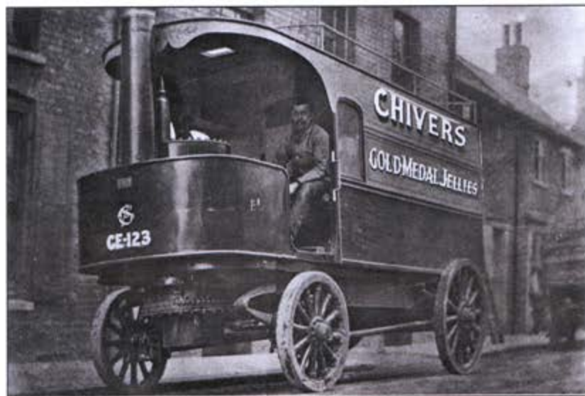
Chivers, the jam makers from Cambridgeshire, one of the many companies who used the LIFU van for their deliveries.

A steam road Motor Train was produced by LIFU, goods and parcels in the van and passengers in the rear car. This plied between Cirencester and Fairford in 1898 - 99 and could achieve speeds between five and eight miles an hour on fairly level roads. Omnibuses constructed by LIFU were used in Mansfield, Kent and Edinburgh. LIFU also made a steam tram which was used in Portsmouth from 1896 to 1901. It could pull two trailers at