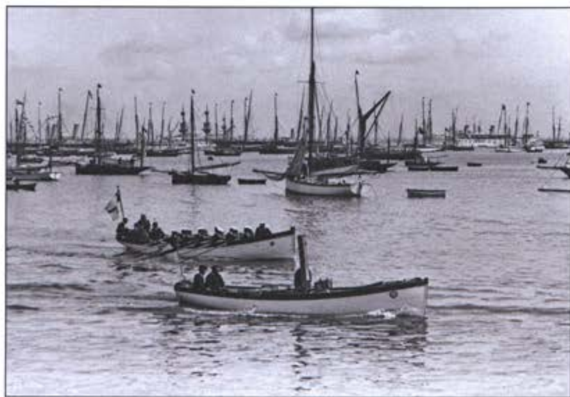
A LIFU launch in the foreground at Cowes Week around 1900.