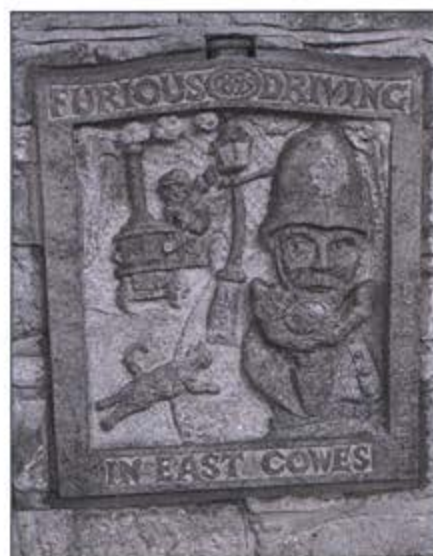
Sculpture by the artist Glyn Roberts showing the first speeding offence on the Isle of Wight. It stands at the junction of Newbarn Road and York Avenue, where the policeman stood in 1899.

Speeds were quoted in his advertising brochures and these must have been