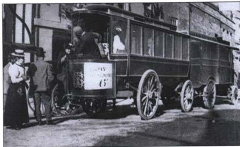
The Motor Train which worked a route between Cirencester and Fairford. Parcels were carried in the front and passengers travelled in the rear.

tested in East Cowes. York Avenue would have provided the hill and perhaps Clarence Road was the good flat straight road! Mr. House regretted that a move to the mainland would have an effect on the working classes of East Cowes - 200 of whom were employed in the works.