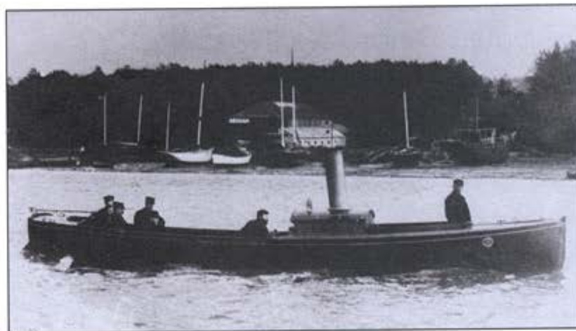
A LIFU launch on the Medina River at East Cowes

Coal took up a lot of space on board a steam boat. To do the same amount of work, the necessary liquid fuel (petroleum) was half the volume, and was cleaner. Symon and House had taken out numerous patents perfecting their boilers and engines, creating a range of engines from 10hp to 125hp. 'Mineral oil' was widely available, priced between 2d and 6d a gallon.