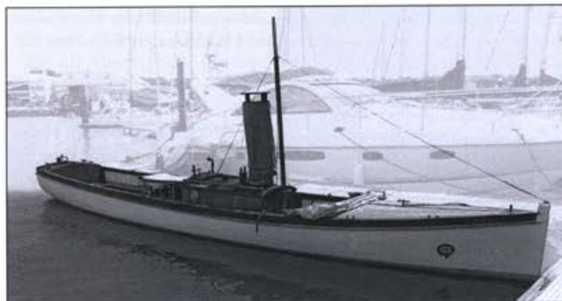
Kariat steam launch moored at Cowes. Once the only surviving LIFU vessel with original engine. Length 35 ft. Beam 6 ft. 9 ins, Engine 35 shp. Boiler pressure 200 lbs. Speed about 12 knots.

in Cowes for which he needed a steam tender, and he used it to cross the Solent to and from his Hythe home.