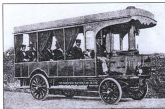
Top: The LIFU Charabanc and Right: The goods van shown in a sales catalogue and demonstrating the economies of using of different bodies on the same chassis.