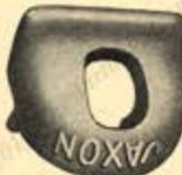
C-57 Galv. C-115 Blk.