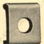
C-73 Galv. C-112 Blk.