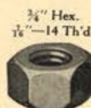
N-4 Galv. N-29 Blk.