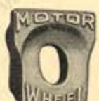
C-66 3 1/2" Rim C-67 4" Rim