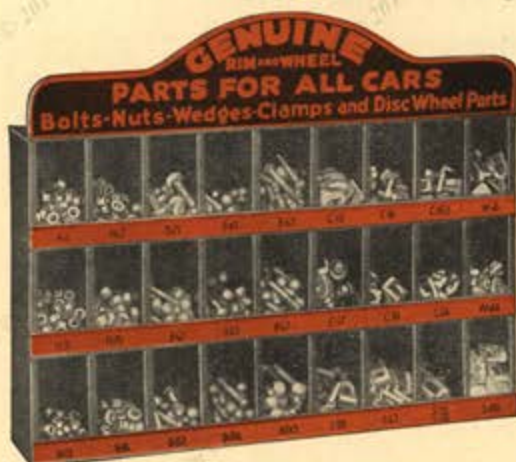
Size 30" Long, 18" High, 6" Deep This picture shows one section complete

These assortments can be purchased individually if you so desire.