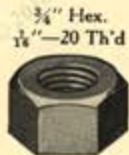
N-1 Galv. N-28 Blk.

*Very Fast Selling Parts. **Fairly Fast Selling Parts.