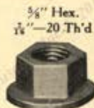
N-2 Galv. N-25 Blk.