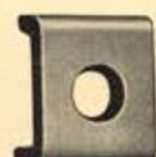
C-62 Galv. C-118 Blk.