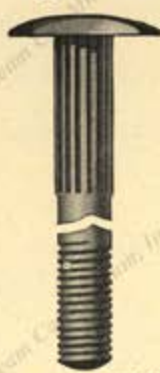
Type No. 2