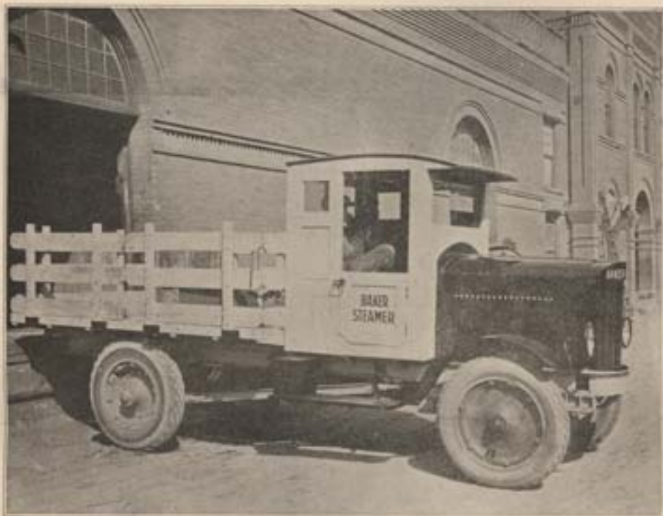
A Baker Two-ton Truck Receiving Freight at the Denver & Rio Grande Depot