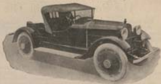
2-Passenger Baker Steamer, Military Sport Roadster

ENGINE —Two-cylinder, Unionflow; double action; Bore 4 in.; Stroke 5 in. VALVES —Sieves balanced. VALVE GEAR —Radial, Baker modification enclosed in oil bath. Baker free engine reversing device. CRANK SHAFT —Built up. Overdrive E. K. F. Ball bearing. COMBUSTION SYSTEM —Baker Atomizing Type burner. Electric ignition. STEAM GENERATOR —Baker Semi-flash type; constant water level. ELECTRIC LIGHTING SYSTEM . AXLES —Columbia standard full-floating with Timken bearings throughout. WATER PUMP —Slow running, engine crank driven, opposed rotors. WATER TANK —Twenty-gallons preheated by exhaust steam. CONDENSER —Radiator.