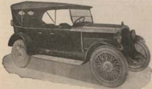
7-Passenger Baker Steamer

FUEL TANK —Sixteen gallons capacity, mounted on rear chassis. Separate compartment with ample reserve supply of air pressure. WHEEL BASE —126 inches. TRAIL —Standard 54 inches. DRIVING GEAR —Four type, engine to axle, 11-2 to 1 ratio. Free Engine Device for emergency use. WHEELS —"Dished" pressed steel type. TIRER —Static cord. STEERING GEAR —"Larvine" Stand-and-type. DRIVE —Steering wheel and brakes on left side. BRAKES —Service, outside contracting. Emergency, inside expanding type. 16-inch drums. SPRINGS —Semi-elliptic. Front 28 in. 2 1/2 in. Rear 24 in. x 3 1/4 in. TORQUE RODS —Of long radii; directly connected from axle to frame. FRAME —4 inches deep. Heat treated alloy steel.