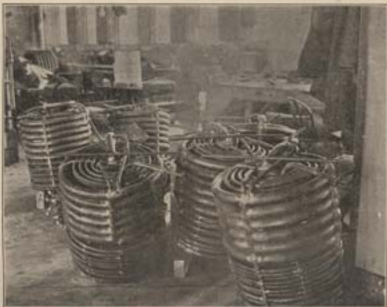
Completed Baker Boilers Manufactured in Our Factory